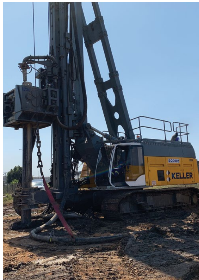
Figure 2. Liebherr LRB 255 crawler rigs equipped with ring vibrators for driving steel tubes.

Installation of rigid inclusions will be carried out by Liebherr LRB 255 crawler rigs specially equipped with model 32 VMR ring vibrators to drive temporary steel tubes to the required depths. The use of the vibratory driving method also allows the rigid inclusion lengths to be installed based on the actual ground condition/profiles rather than to some designed depth which may be inadequate or over-conservative in highly variable ground conditions.