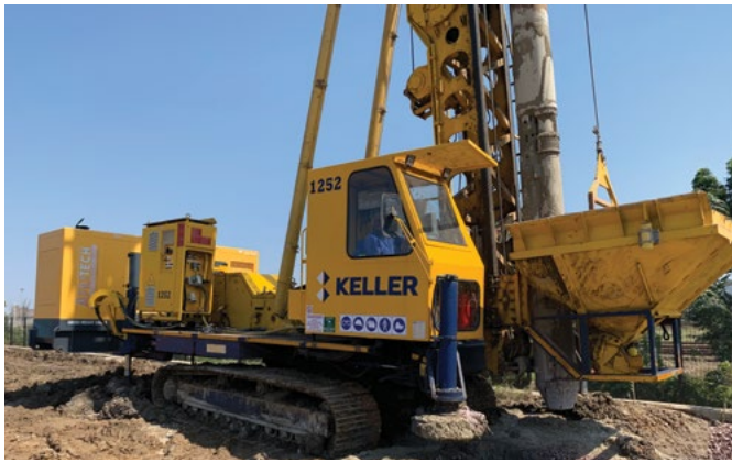
Figure 3. Keller vibrocat used to install stone head.

To date Keller has executed over 30 000 CMMs to support various structures on the Clairwood site. Settlement cells were installed on the first fully constructed platform to monitor the operational settlement. These results were published by Chang (2019), with differential settlement of less than 10 mm measured over plan distance in excess of 100 m.